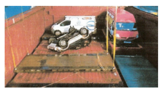
The 4x4 after the incident

Cargo operations were being carried out by a shore crane operator and contract stevedores; no ship's crew were involved. All personnel engaged in the loading were suitably experienced and were in date for training with regards to their respective roles, there were current certificates where applicable and all lifting equipment used was in date within a six-monthly inspection routine. A six-monthly inspection routine was carried out by a third party contractor instead of a more normal annual inspection.