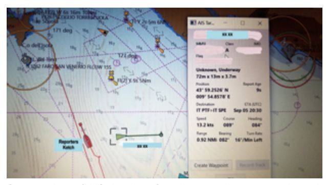
Screen shot of AIS display after the round turn to starboard

resumed my original course. I tried calling the other vessel on VHF Channel 16 to alert her to the near miss, but there was no reply. I then took a screen shot of the AIS.