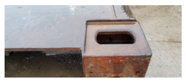
Chamfer on the lifting socket can be clearly seen.