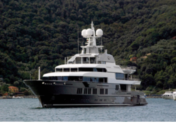
The 72m motor yacht safely at anchor the following day

The reporter did exactly what he should have done by following the Collision Regulations, and the system worked. Regardless of the failure of the other vessel to comply with the regulations, the actions of the reporter ensured the safe arrival in port of both the reporter's ketch and the other vessel despite the latter's demonstration of poor seamanship.