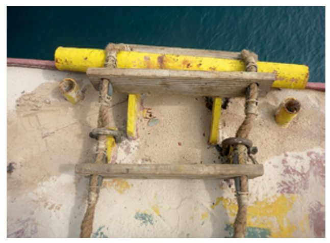
Pilot ladder incorrectly secured to the deck using D-shackles to choke the side ropes.

This inaugural article in our new section has been written by a senior pilot