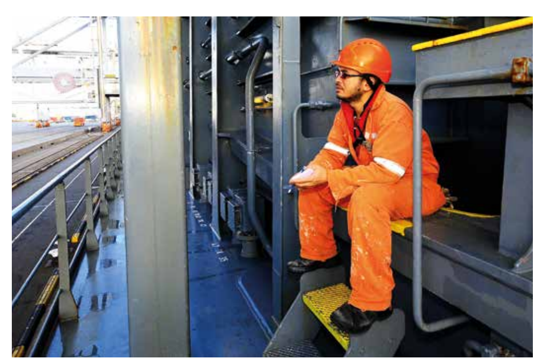
Fatigue continues to be a major cause of accidents at sea. Are accurate hours of rest records kept on your vessel?

Recently, several organisations have been taking a closer look at one of these elements – fatigue. Studies are being conducted to analyse the way hours of work are calculated, which watchkeeping systems contribute to fatigue, and how we can minimise fatigue at sea.