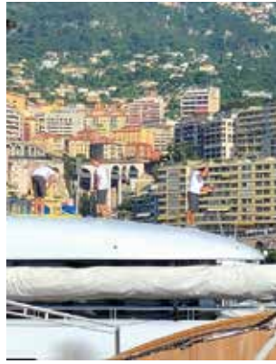
The photos clearly demonstrate the lack of crew safety awareness and a poor on board safety culture.